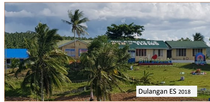
Dulangan ES 2018

In 2017, SDEL received the MD4 Academy Award of Lions , Large Club Project of the Year for the Legacy Project in Dulangan Elementary School.