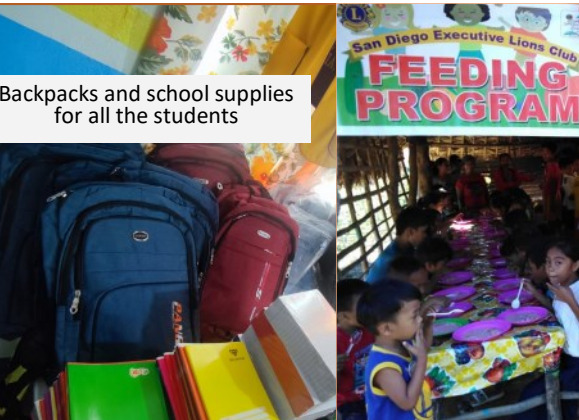
Backpacks and school supplies for all the students