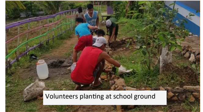
Volunteers planting at school ground