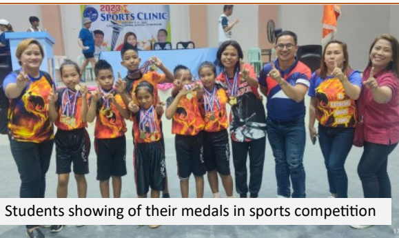
Students showing of their medals in sports competition