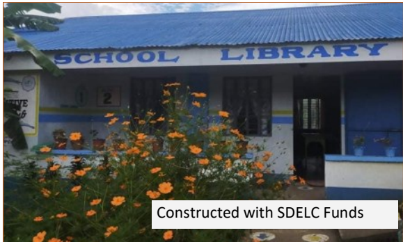
Constructed with SDEL Funds