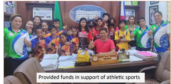
Provided funds in support of athletic sports