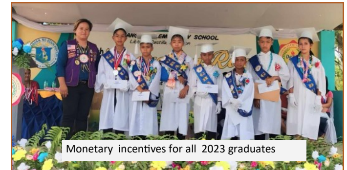
Monetary incentives for all 2023 graduates