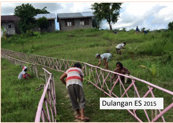
Dulangan ES 2015